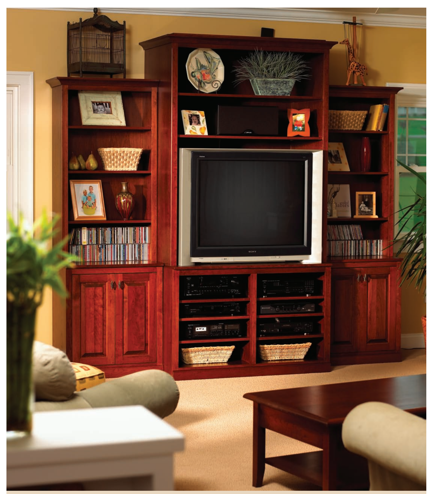
Large Screen Entertainment Center in Cherry with Kodiak Finish. Private Residence