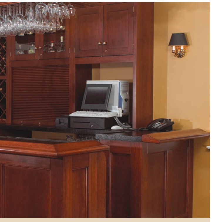
Hills Country Club, State College, Pennsylvania