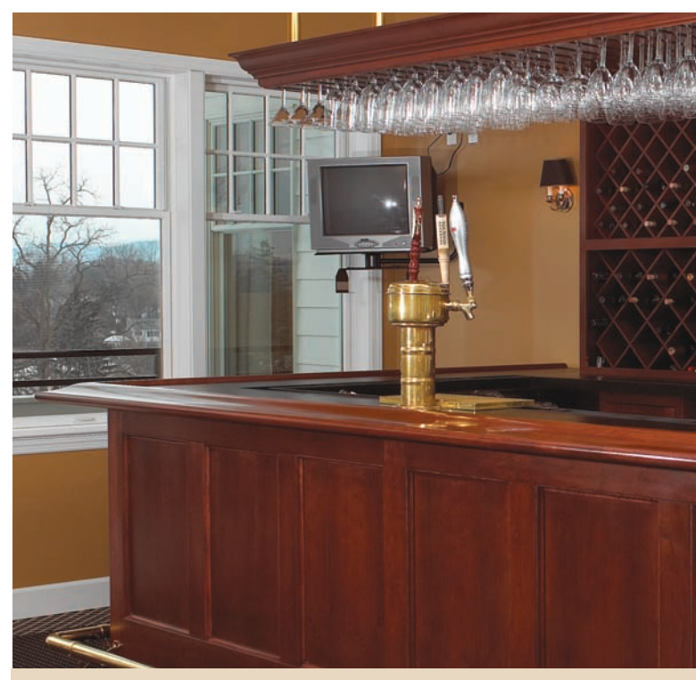
Custom Bar with Storage in Cherry with Mahogany Wine Stain. Centre

Spectra Wood has been crafting quality, American-made furnishings for more than 30 years. To make sure our commercial and industrial furnishings are both durable enough for busy offices and beautiful enough to grace your executive boardroom, we use only solid American hardwoods like red oak, hard rock maple and Pennsylvania black cherry. Every piece we produce is built with old-fashioned attention to detail, using the latest woodworking technology. We pride ourselves on being a large enough operation to handle volume orders yet small enough to give each piece and each customer the care they deserve.