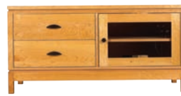
48" Widescreen TV Stand 48w x 22d x 24h - F215