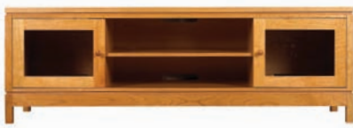
72" Widescreen TV Stand 72w x 22d x 24h - F229