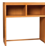
48" Entertainment Hutch 48w x 17d x 48h - F172 60" Entertainment Hutch 60w x 17d x 54h - F173 72" Entertainment Hutch 72w x 17d x 60h - F174