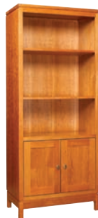
Stereo Unit 30w x 17d x 72h - F175