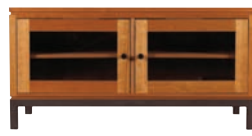
48" Widescreen TV Stand 48w x 22d x 24h - F155