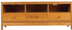
60" Widescreen TV Stand 60w x 22d x 24h - F221