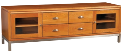
72" Widescreen TV Stand 72w x 22d x 24h - F168