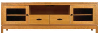
72" Widescreen TV Stand 72w x 22d x 24h - F231