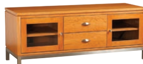
60" Widescreen TV Stand 60w x 22d x 24h - F162