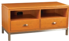
48" Widescreen TV Stand 48w x 22d x 24h - F156

With its trademark one inch thick top, separate base and contemporary design, our Franklin Media collection introduces many pieces to help create a custom home entertainment unit. Various widths and heights make it easy to configure any combination to fit your specific area, as well as offering stained wood, black metal, or stainless steel bases.