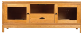
60" Widescreen TV Stand 60w x 22d x 24h - F222