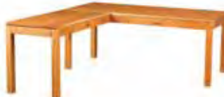
Desk with Left Return 72w x 78d x 30h - F140