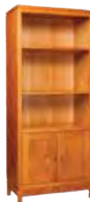
Shelving - 72" Bookcase 36w x 13d x 72h - F125

Check price list for more available models.