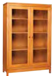
Glass Door Bookcase 40w x 17d x 60h - F132