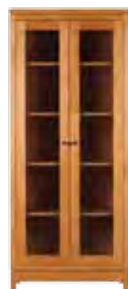
Tall Glass Door Bookcase 30w x 17d x 72h - F133