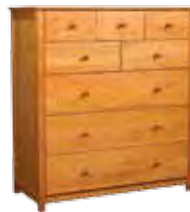
Eight (8) Drawer Chest 48w x 20d x 39h - M113