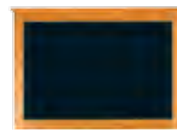
Horizontal Mirror 40w x 1d x 28h - M116