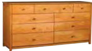
Nine (9) Drawer Dresser 68w x 20d x 34h - M114