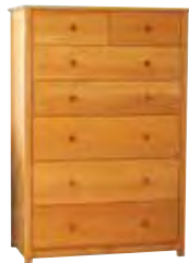
Seven (7) Drawer Dresser 36w x 20d x 53h - M111