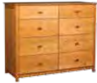
Eight (8) Drawer Dresser 42w x 20d x 46h - M112